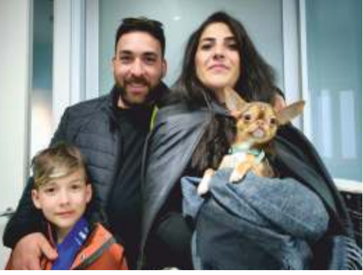
project - is now neutered

Dorothea Friz www.fondazionemondoanimale.com (revised version!)